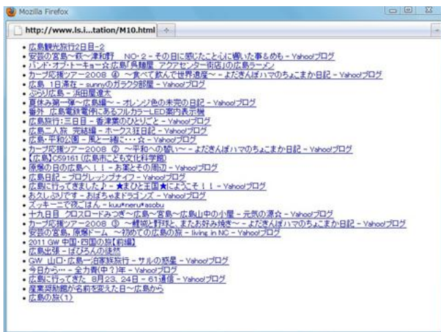
Figure 4. A list of links to Hiroden blog entries.