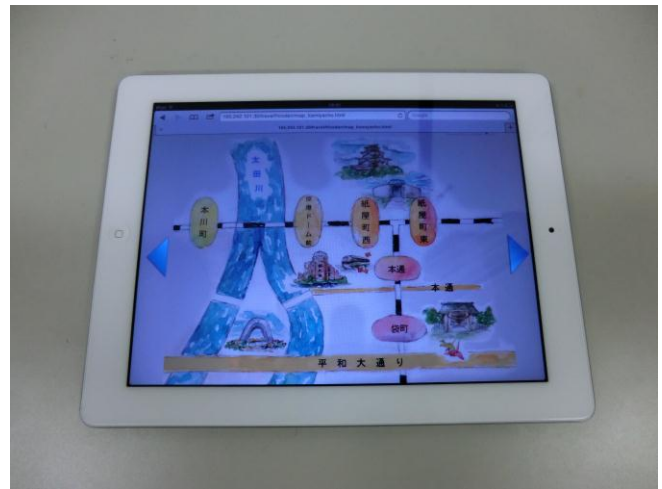
Figure 1. A snapshot from our system on the iPad.

In this section, we describe our prototype system. Fig. 1 is a snapshot of its behavior on the iPad. The system operates with a browser.